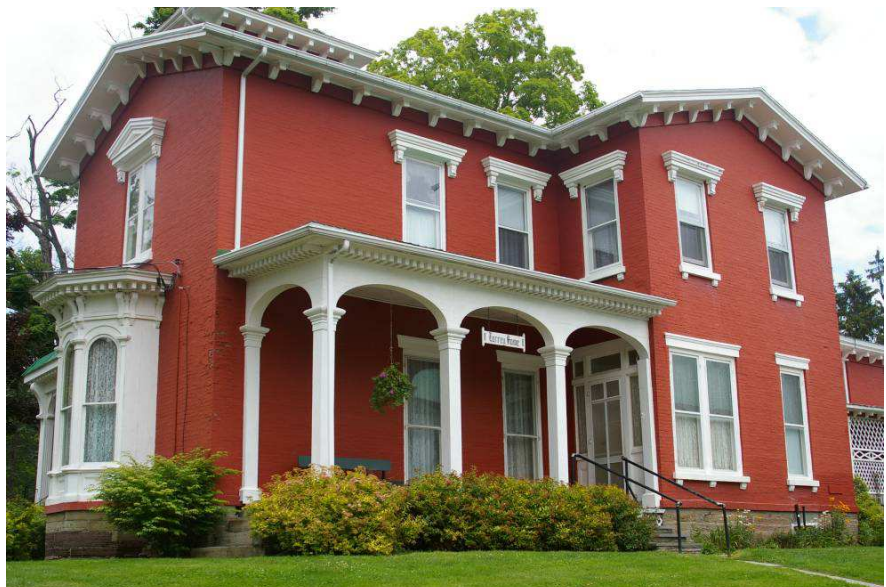
The beautiful Torrey Home at the Montrose Bible Conference

You will be welcomed to our Homecoming by Jesus Abbey members and the Torrey family. The weekend's events will be in both English and Korean.